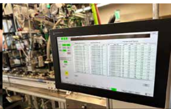
Real Time Machine Data Analytics