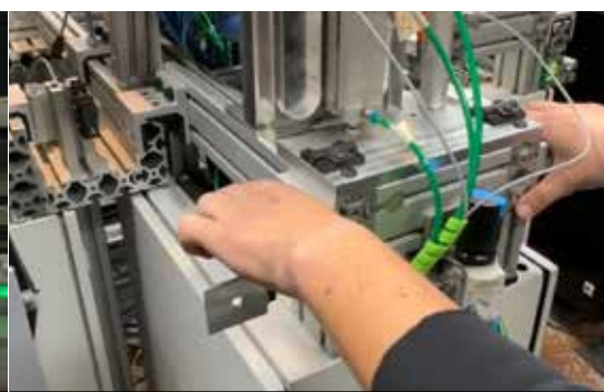
Modulated Cassette Design