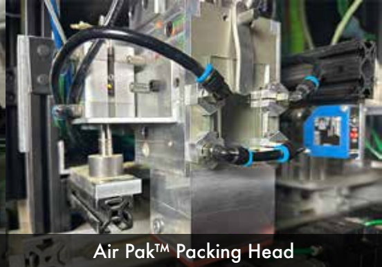
Air Pak™ Packing Head